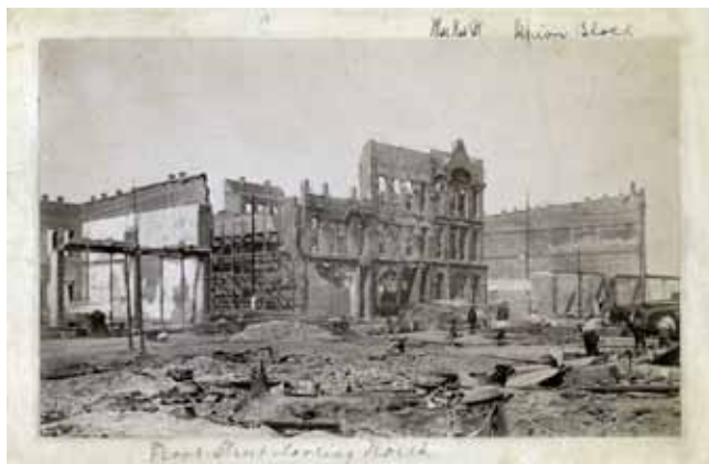
Photograph taken after the 1889 fire in Seattle

catastrophic fire in 1889 burned down 65 acres of Seattle's downtown for lack of water to put it out. Citizens had had enough and they made the decision to invest in re-building the infrastructure required to secure a safe, healthy and abundant supply of clean water.